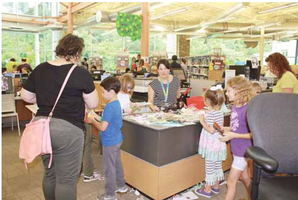
Cutting and pasting attracts the creative types.