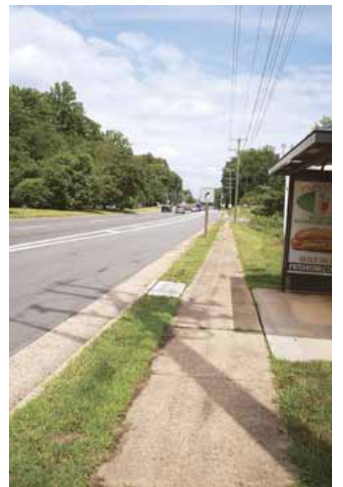
Along Braddock Road behind the Kings Park Shopping Center, one of the pedestrian bridges is planned for this area.

moval, but there wasn't a solid answer on who will have that duty if we get a significant snowfall in the future. Cook suggested that the nearby residents could possibly help out in such a situation by throwing some salt down or shoveling a little.