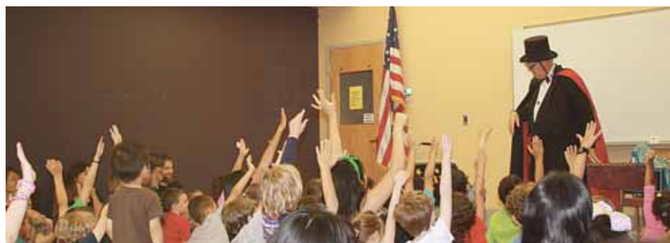
Can I get a volunteer from the audience?

On the library's 10 th anniversary event, Saturday, June 23, the camaraderie at the library was present again, as parents and